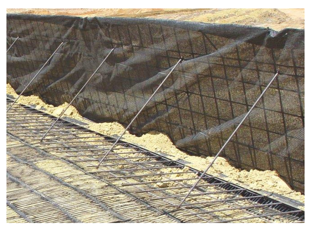
Figure 3 Steel brace bars fixed in position to maintain the required 70<sup>0</sup> face angle