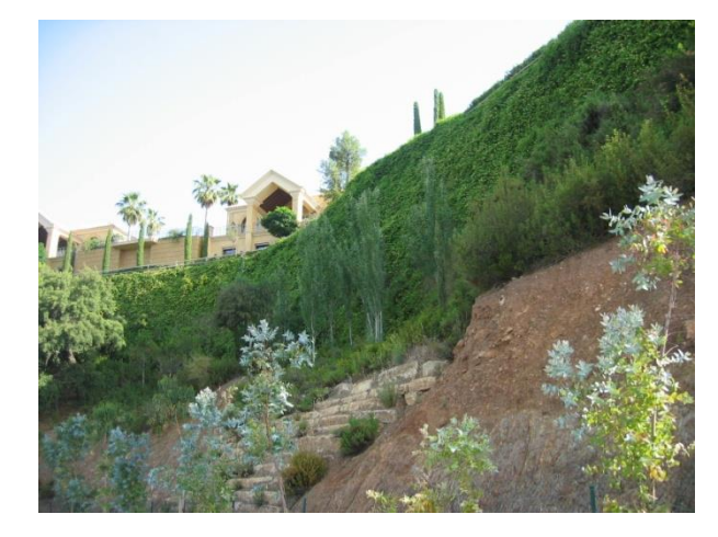
Figure 1 Fully vegetated TensarTech GreenSlope

TensarTech GreenSlope System has been developed to provide Engineers, Architects and Builders with an attractive and economical earth retaining solution. The system, comprising proprietary steel facing units and Tensar uniaxial geogrid reinforcement, is one of a range of earth retaining systems available from Tensar International in the UK.