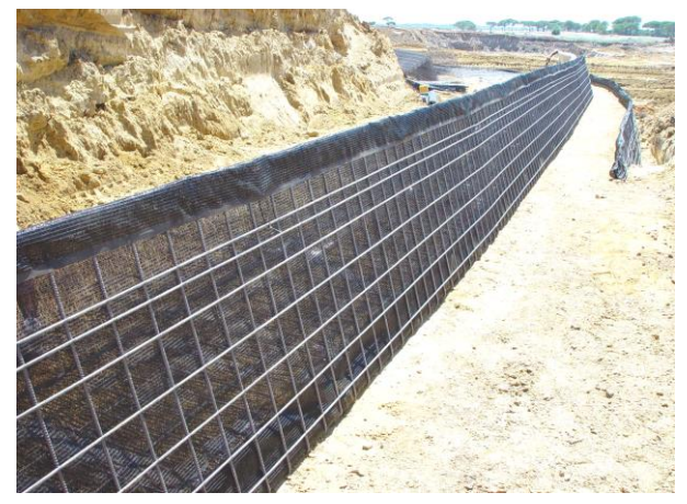
Figure 4TensarTech GreenSlope facingpanels in place prior to backfilling