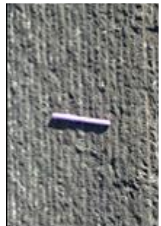
Figure 1: Finely milled substrate