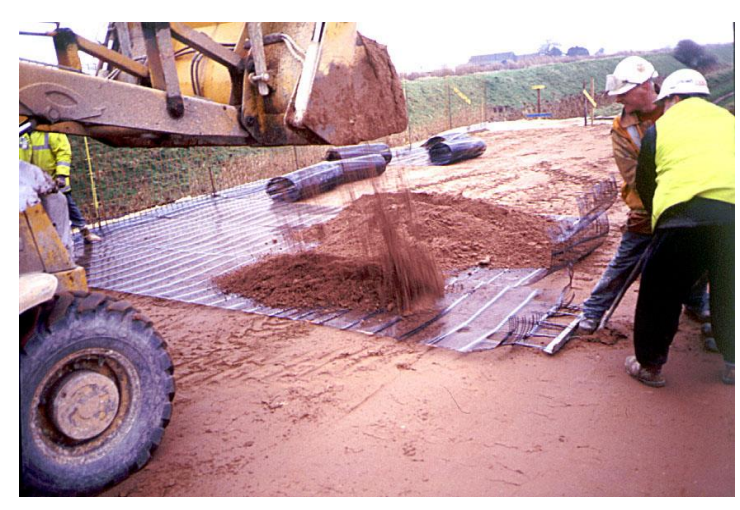
Figure 5 – Tension the geogrid and placing the fill