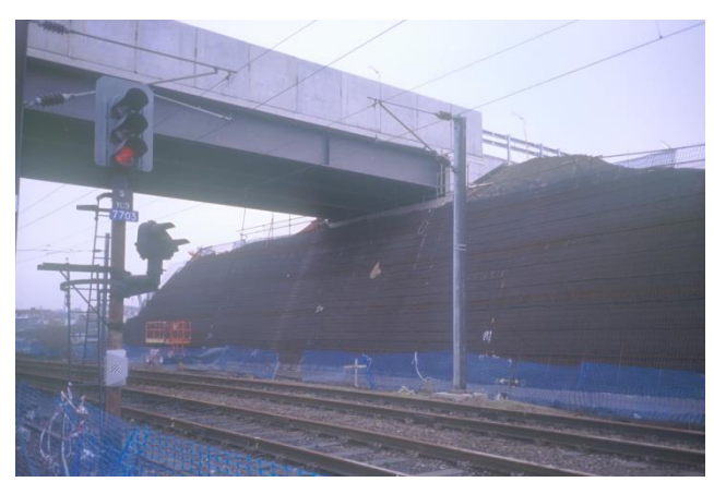
Figure 1 TensarTech TR2 temporary bridge abutment

Where applicable, the Contractor shall ensure that the installation fully complies with CDM Regulations 2007 and should refer to the Designer's Risk Assessment and COSHH statements.