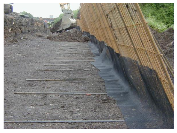
Figure 2 - L bars and face units in place